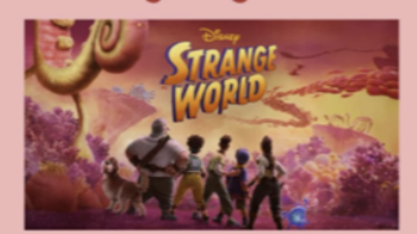
Monday February 20, 2023 1:00 pm Free to attend Concession items: $2 Plamondon Festival Centre, Canadian Natural Theatre