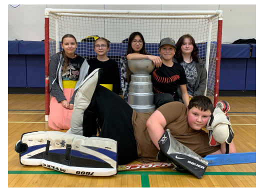
Grade 8 Predators

before the series of playoff matches. Congratulations to all of the participants for a great show of sportsmanship and to the winning teams who will have their name added to our Stanley Cup!